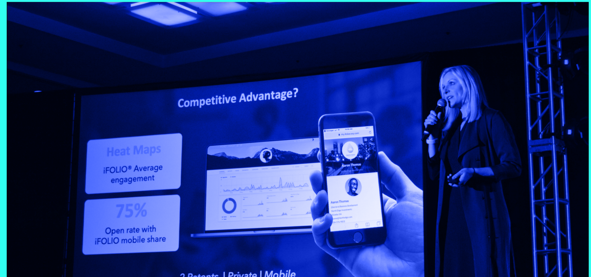
Tech Demo Session Slot Live On Stage