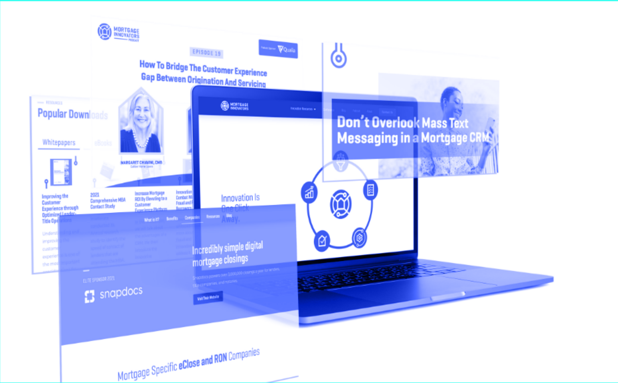
1-Year Innovator Partnership with Mortgage Innovators [$4,800 value]