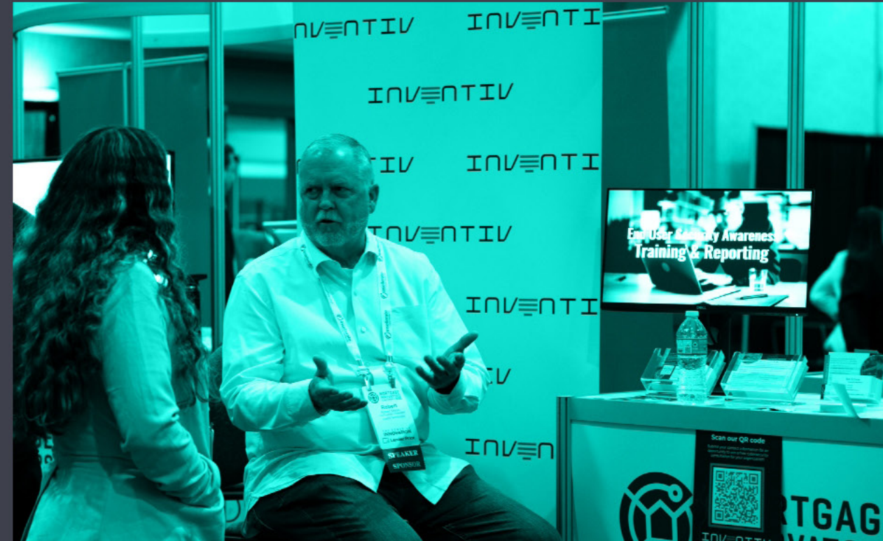
Kiosk inside innovation lab