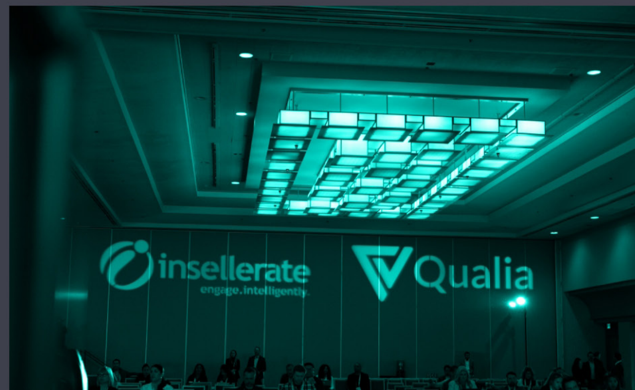
Custom Gobo Light of sponsor logo splashed on general session ballroom side walls. Premier Sponsor ONLY benefit.