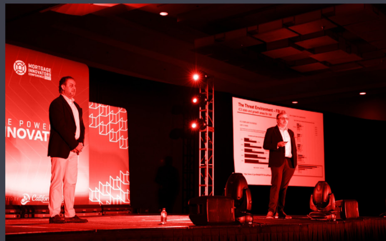
15 min thought leadership Tech Talk session LIVE on the Innovation Stage. The session is also recorded and delivered as high quality video post conference.