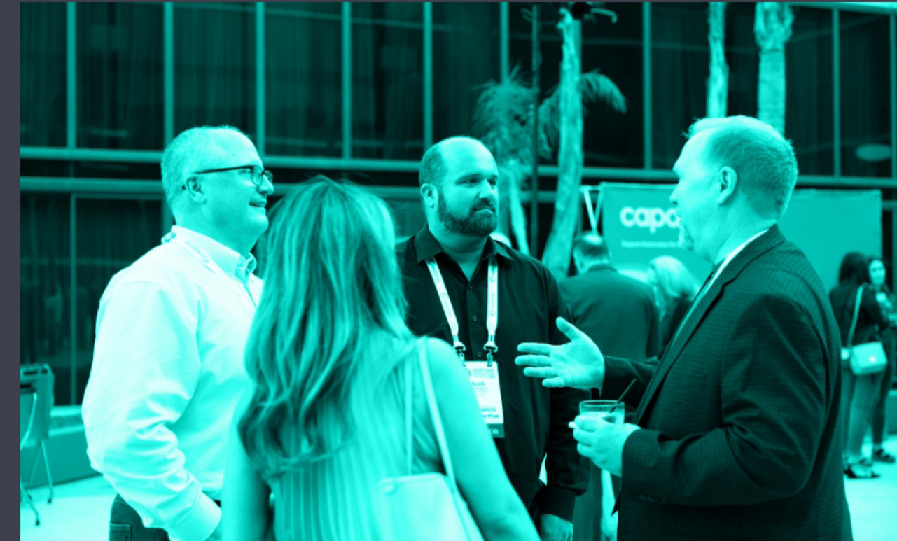
Exclusive space for the Innovation Deck Party. Premier Sponsor ONLY benefit.