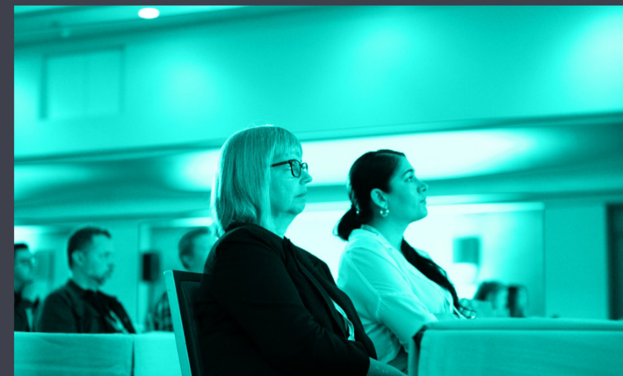
8 comped registrations