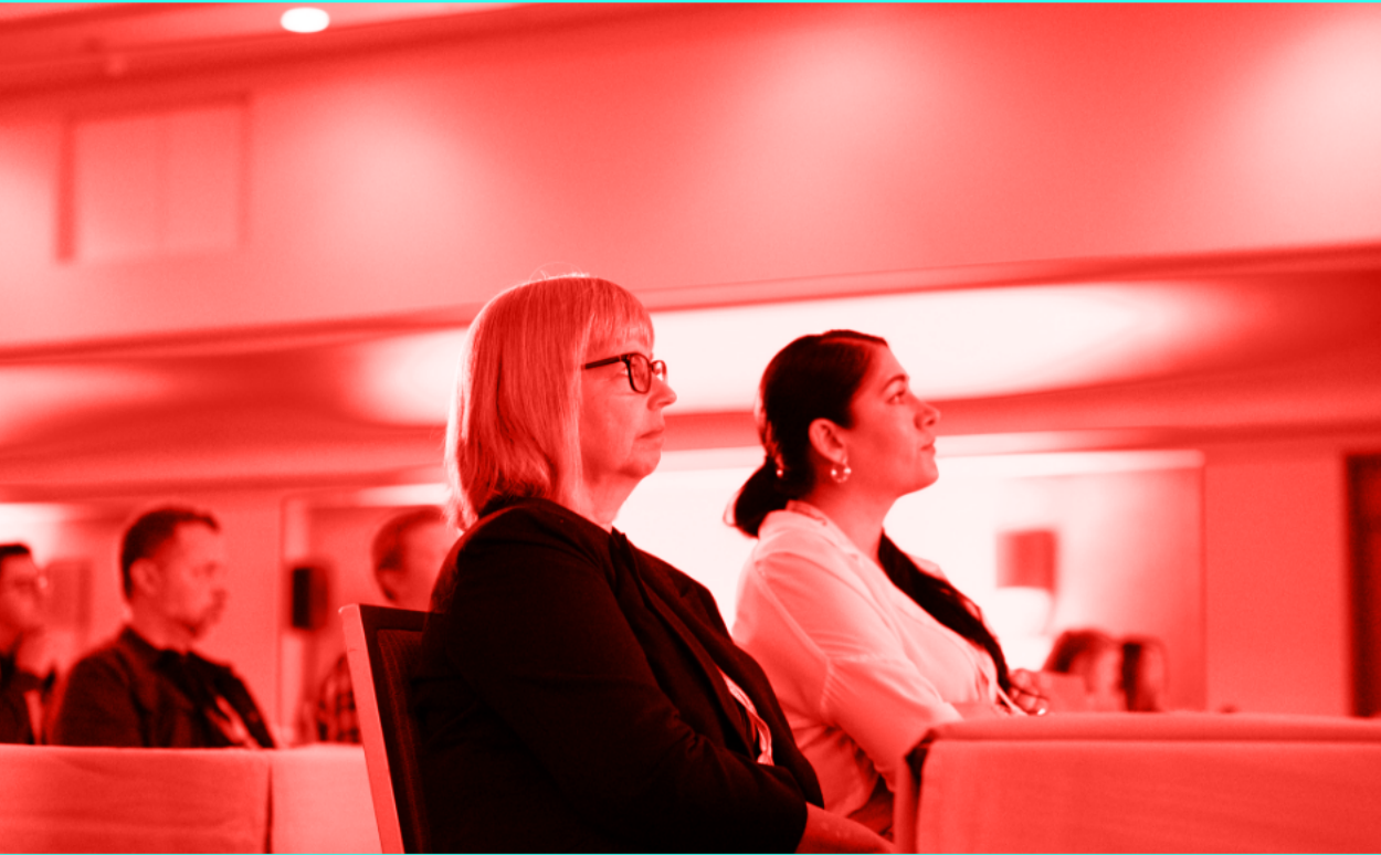
3 comped registrations