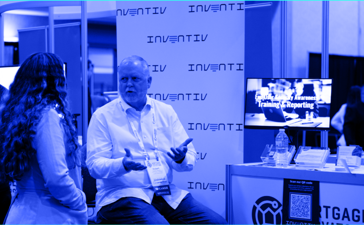
Kiosk inside innovation lab